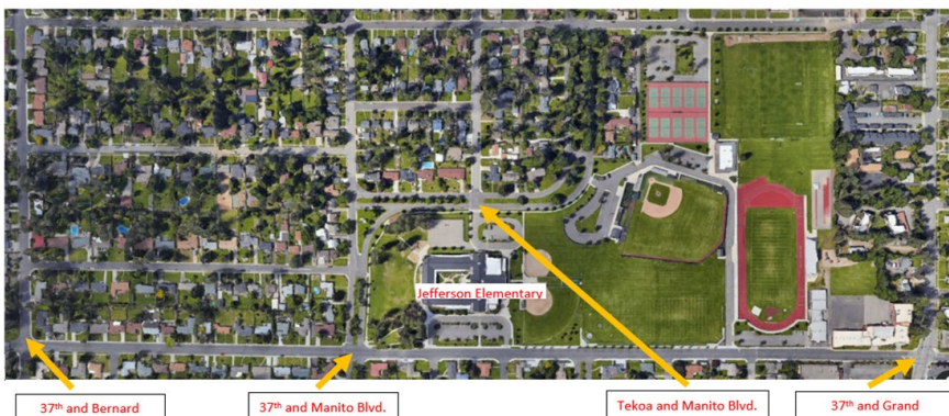
Jefferson Elementary School Adult Monitored Safety Patrol Crossings